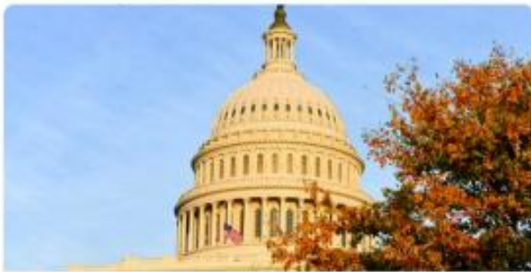
Cotton, Menendez, and Colleagues Introduce Taiwan Assurance Act cotton.senate.gov

China's growing aggression against Taiwan makes the U.S.-Taiwan relationship more important than ever. 40 years after the Taiwan Relations Act was passed, I introduced a bill that would further improve our relations with this strategic partner.